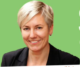
Cate Faehrmann, Senate candidate